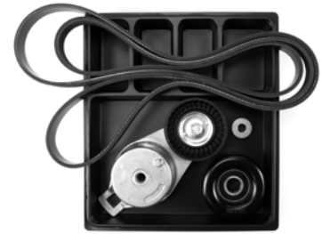
Components of the Gates Complete Serpentine Kit are sealed and packed securely to maintain outstanding quality and condition during shipping.